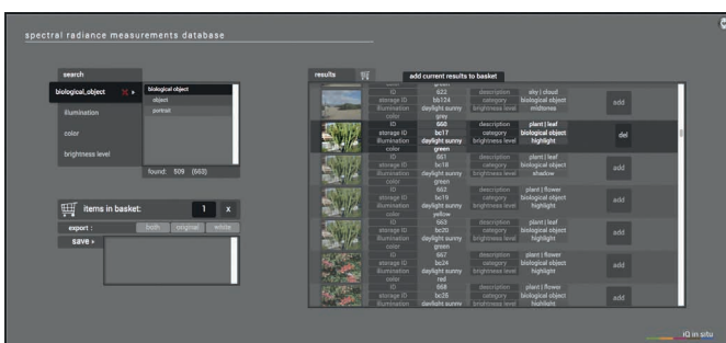
Selection of biological objects

Until now, the only commonly known source for in-situ measured spectral radiances was ISO 17321-1, which provides spectral radiances for 14 common objects. Our database has approx. 2500 spectral radiance measurements using numerous objects and lighting situations. Each object is available in two variants, incident light and white tile corrected.