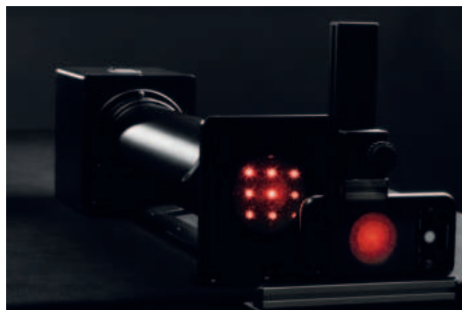
A mobile phone under test