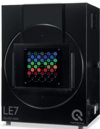
LE7 with the TE292 XL chart

The TE292* has been adapted from the front plate of the camSPECS device. This chart has been developed to be used primarily with the LE7 for camera calibration with iQ-LED illumination.