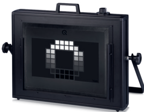
LG4 with OECF test chart TE269

The Controller Area Network (CAN) system allows up to 99 LG4s to be connected and controlled by the LG software.