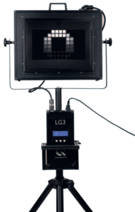
LG3 with support