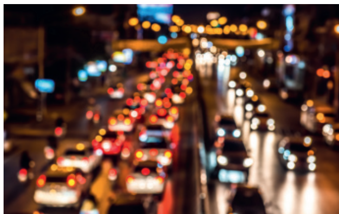
A wide range of light frequencies that are capable of being recreated with the LG3