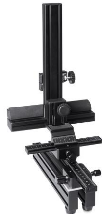
iQ-Align for CAL3