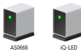
Hardware Manager: active iQ-LED and spectromete