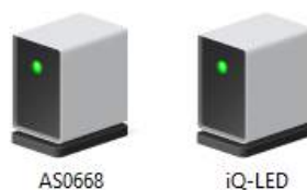
Hardware Manager: active iQ-LED and spectrometer