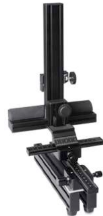
iQ-Align for CAL1