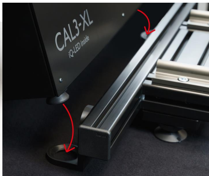
Connecting the iQ-Align XL to your CAL3-XL / LE7