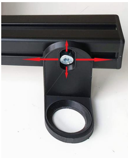
Adjusting the position

To attach the iQ-Align XL to the CAL3-XL / LE7 you now only need to slightly lift the front feet up, slide the locking rings of the iQ-Align XL under them and carefully lower the feet into them.