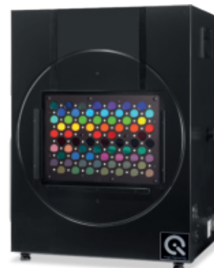
LE7 with TE292B VIS-IR