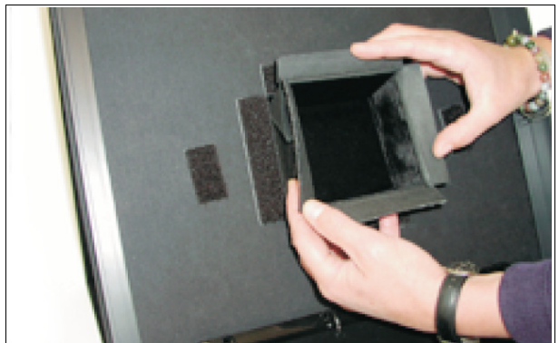
Insert box into the opening in the back of the folder and fix the jutting parts at the velcro. Now flip back the charts.