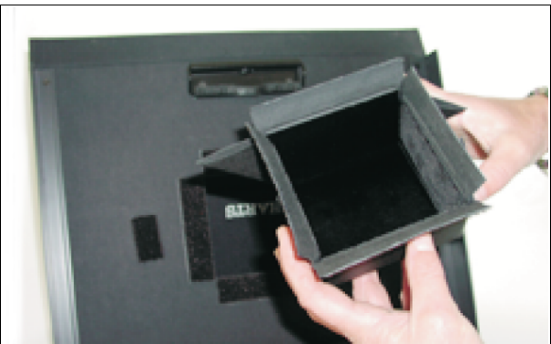
Fold up all sides of the box and flatten the jutting triangles at the sides.